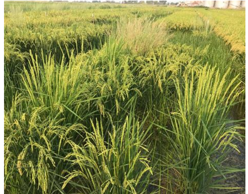
M-206 +30% Koshihikari

Some M-206 (filled), Koshihikari (tall heading), and sprangle top RFBR plants surviving