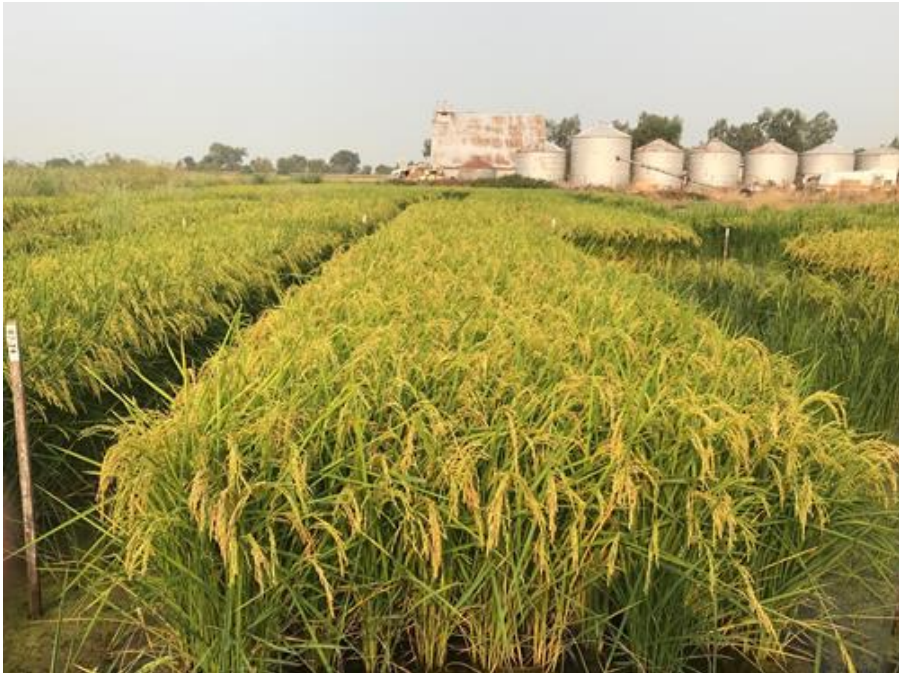
17Y3000 +30% Koshihikari

No Koshihikari plants and complete weed control